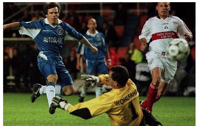
Gianfranco Zola, left, scoring in the old Europa League Cup Final for Chelsea against Stuttgart.