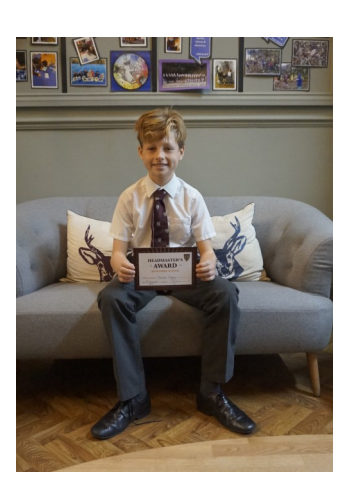
Well done to the Lower School Stars of the Week