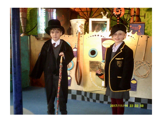
Here are 2A and 2W re-enacting Augustus Gloop falling into the Chocolate river.

We made some fantastic dream bottles after gathering inspiration from the wonderful variety of artefacts found in the museum.